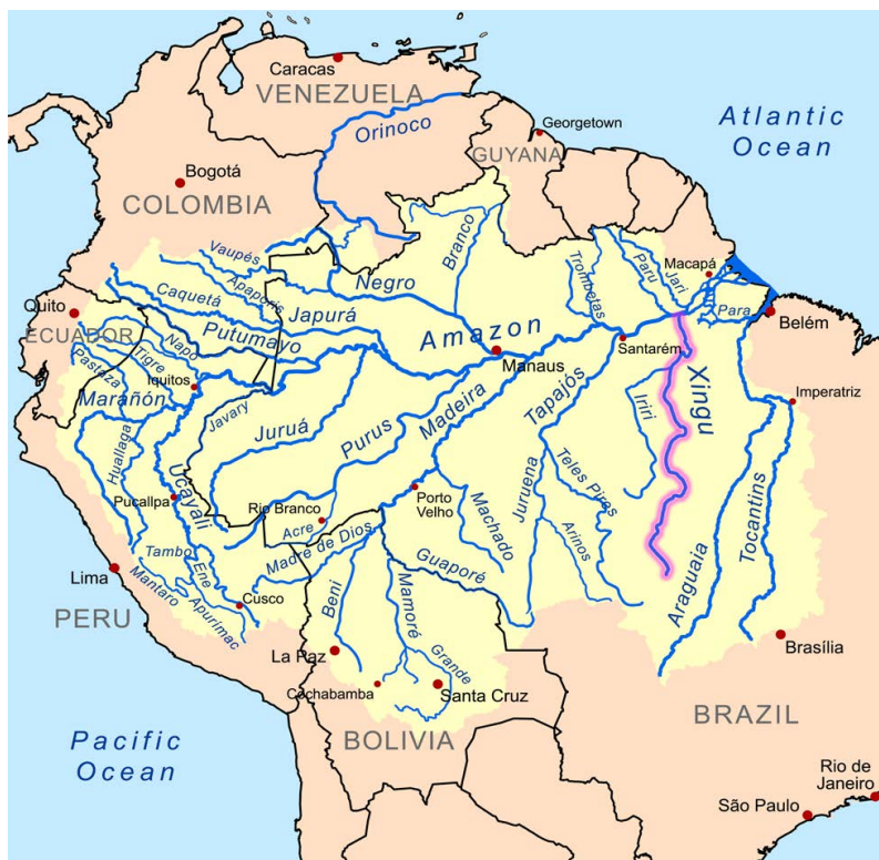
Figure 4 The Xingu River amid the Amazon River basin. (Adapted from Wikipedia.org) URL: https://en.wikipedia.org/wiki/Xingu_River#/media/File:Xingurivermap.png

Apart from establishing that the language spoken in the various Bakairi villages belonged to the Carib linguistic family, von den Steinen also considered