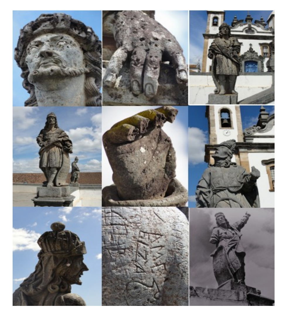
Figure 6: Photographs showing both anthropic and natural vulnerability of the statues symbolizing the prophets present in the Bom Jesus do Matosinhos churchyard. Advanced weathering processes, depredation with breaks in parts of the monument, graffiti, formation of biological accumulations, patina, black crusts, and impurity deposits are noted. The last photo dates from the end of the 19th century, where part of the arm was broken probably due to explosives.