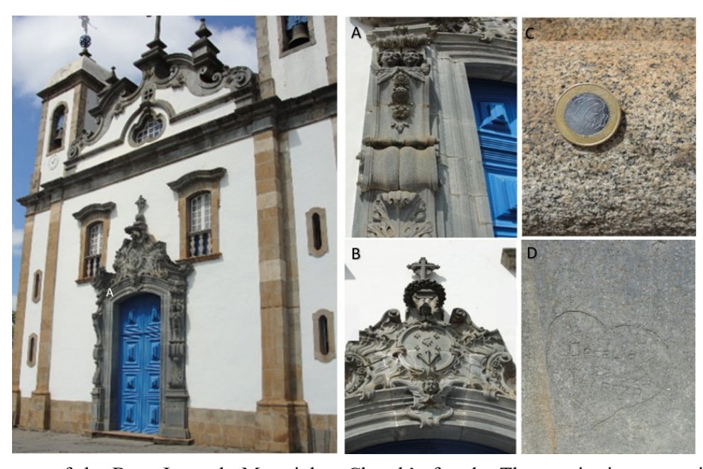
Figure 3 : Features of the Bom Jesus de Matosinhos Church's facade. The granite is present in the base columns and bell towers, while the soapstone occurs in the doorway (A), cornice, oculus, cross and ornaments (B). Note the yellowish color of the granite due to the presence of patina and dust (C) and the depredation with an inscription on the column (D).

In the churchyard it can observe the presence of a sculptural set composed of twelve statues representing the prophets, access stairs, wall, cartouche and partial floor covering, all produced with the use of soapstone. What draws attention in this set is the great variation of shades presented by this rock, which varies from greenish to slightly blue tones, passing through grayish ones. As for other structural and textural elements, the rocks are sometimes massive and isotropic, sometimes with striking foliation. The heterogeneity observed for the types of soapstone used in the churchyard is indicative that these materials come from different extraction points or represent textural variations present at the site from which they were taken (Neves et al. , 2016). In the Passos chapels, steatite was used in the making of cartouches, balusters, internal and external floors, doorposts and lintels, cornices, columns and stairs.