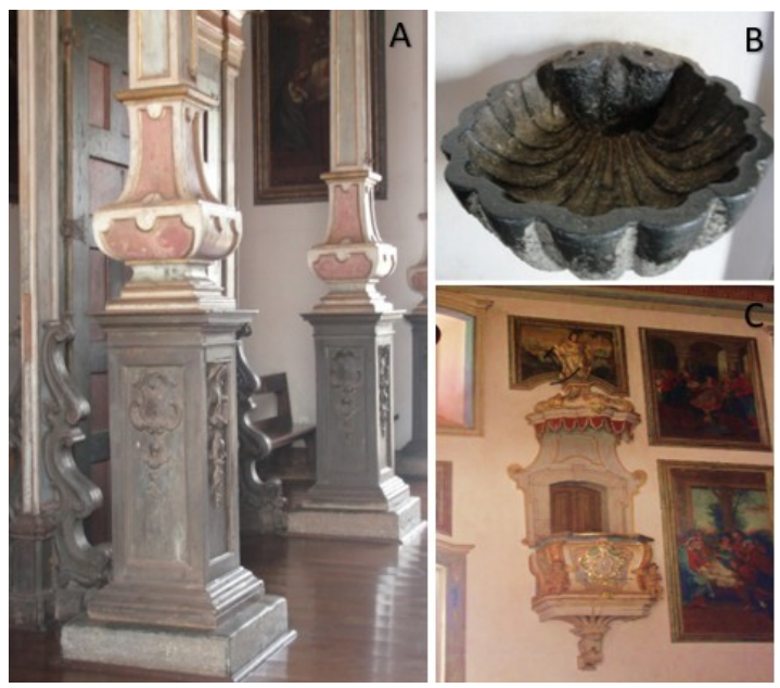
Figure 4: In the internal portion of the church, soapstone was the only stone material used. It is present in the staircase and outline of the high altar, besides the columns (A), bases, sinks (B), pulpits (C), arch, eaves, oculus, windows, doors and part of the floor present at the entrance.

The buildings belonging to the historic urban center, streets and their respective paving, as well as walls and other structures, which still preserve elements that recall the characteristic architecture of the colonial period, are part of Set 2. The streets and their respective elements, such as curbs and paving were produced only in the late 19th century and early 20th century, granite being the main stone material used. The paving technique used is known as pé de moleque ( Figure 2 ). As for the civil buildings, they already present important interventions carried out during the 20th century. However, it is still possible to identify traces that remind us of the 18th and 19th centuries architecture in some cases. In some of these buildings, constructed in stone masonry, it is possible to identify the presence of pebbles and gravel taken from alluvial deposits of the region's streams and rivers. Those built with the wattle and daub technique, on the other hand, use materials such as clay and sand also from the region's deposit.