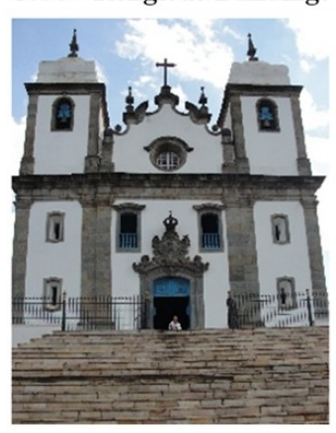
Figure 2: Cultural heritage classification in Congonhas, Minas Gerais.