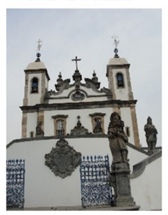
Set 1 - Devotional