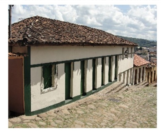
Set 2 - Road Works and Civil Constructions