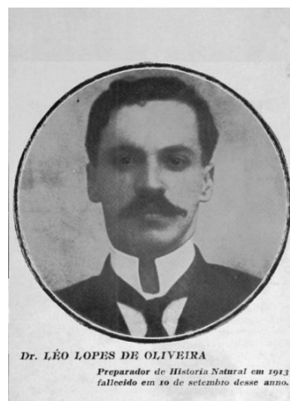
Figure 3. Revista de Medicina , São Paulo, v.1, n. 1, 1916