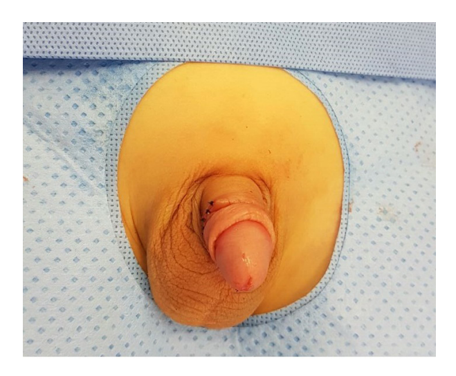
Figure 5 - Post-operative aspect of a buried penis, after reconfiguration of penile and preputial skin