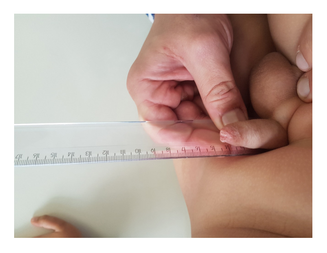
Figure 7 - Obese patient with FOUPA. Note that with compression of the prepubic fat the penile measurement is normal