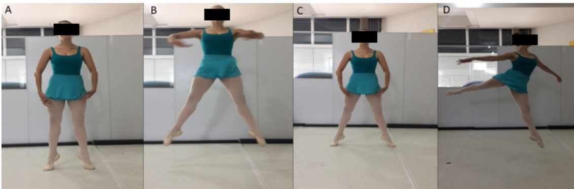
Figure 5. Image of the adapted movement denominated Sauté elevé (A), Echappé elevé (B), Echappé elevé (C), Pose Temps Levé en arabesque (D).