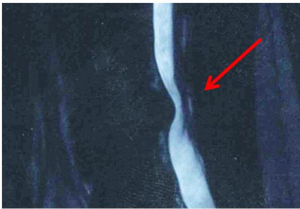
Figure 7. Pre-intervention. Lumbar disc herniation at the L4-L5 level. Sagittal section demonstrating invasion of the medullary canal of the hernia at level L4-L5.

Figures 7 and 8 present a comparative analysis of the magnetic resonance imaging, evidencing the reduction in disc herniation and spinal canal invasion, demonstrating the therapeutic effectiveness of this intervention modality.