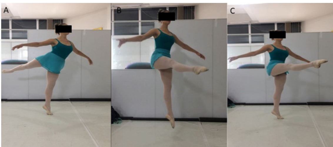
Figure 6. Image of the adapted movement denominated Pose temps levé en arabesque relevé (A), temps levé devant (B), temps levé devant relevé (C).