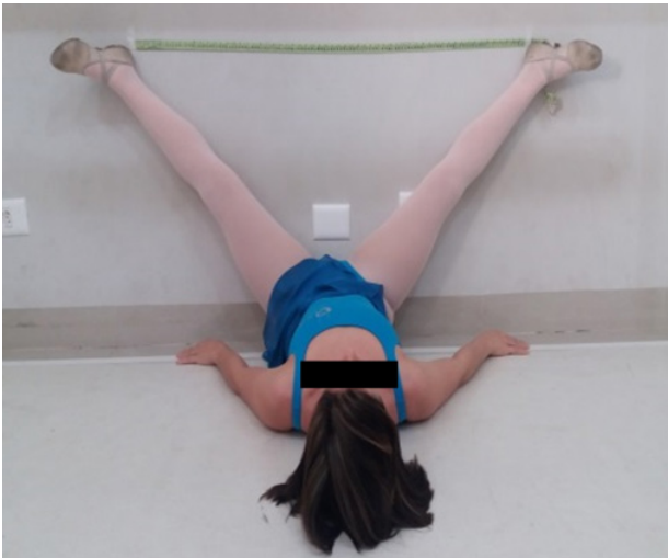
Figure 1. Performance of the flexibility test.

To evaluate the angle of flexibility, the student was placed in a position using the wall as a base, and a tape measure was used to measure angle of amplitude of the lower limbs (Figure 1).