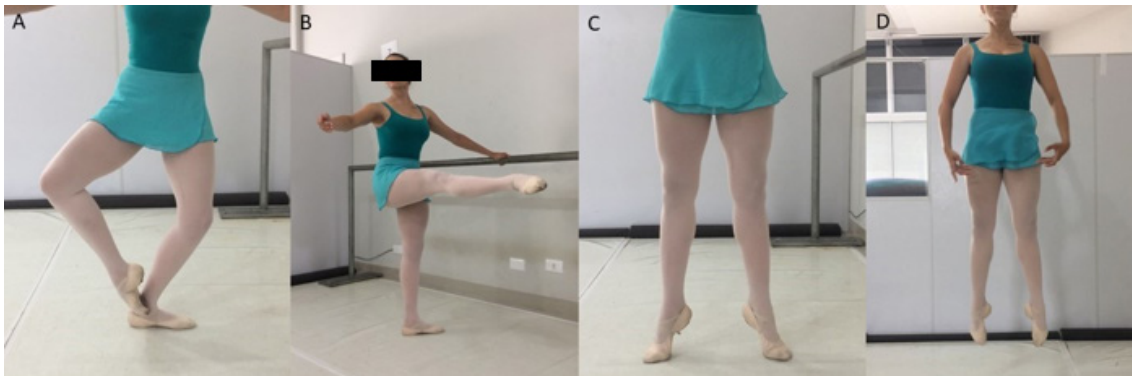
Figure 4. Image of the movement denominated Battement Fondu (A), Grand Battement (B), Elevé (C), Sauté (D).