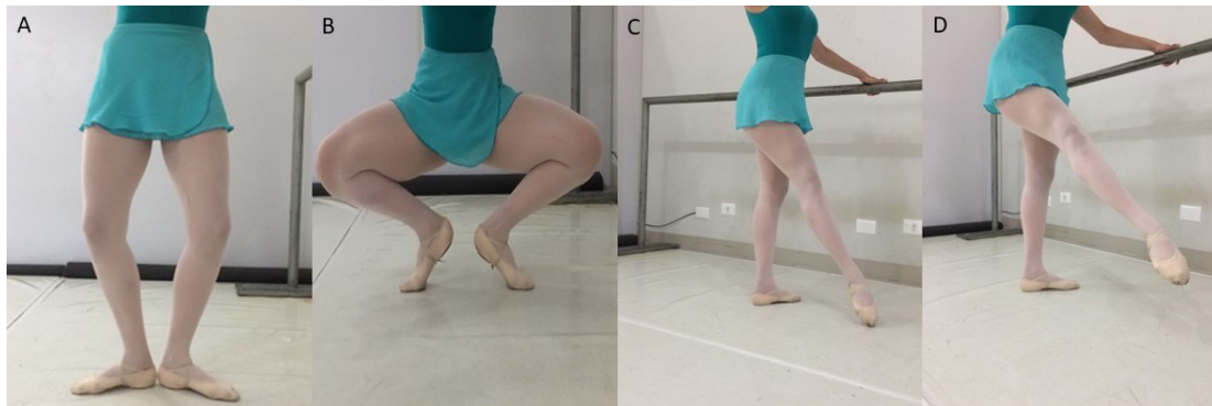
Figure 2. Image of the movement denominated Plié (A), Grand Plié (B), Tendu (C) and Jeté (D).