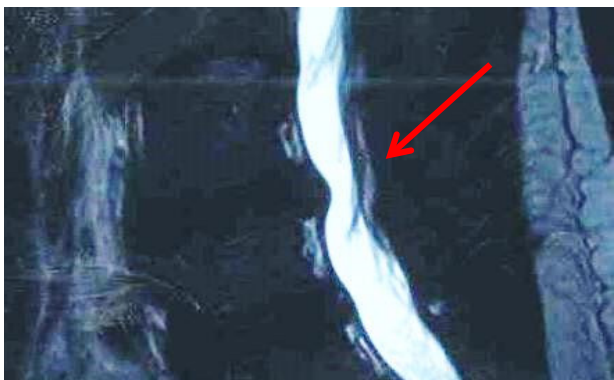
Figure 8. Post-intervention. Lumbar disc herniation at the L4-L5 level. Sagittal section demonstrating the reduction in invasion of the medullary canal of the hernia at level L4-L5.