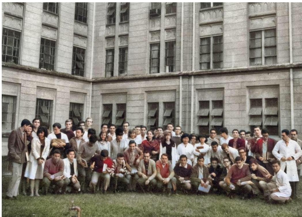
Figure 1. The first photography of all students of the 54th Class.

All the classes that graduated from this or other schools or courses believe, to a greater or lesser extent, that they were unique, that they had very special characteristics. Therefore, I have the right to present some of them, which I think are peculiar to the 54th. class, to which others may be added by you in the next few days when we will be together.