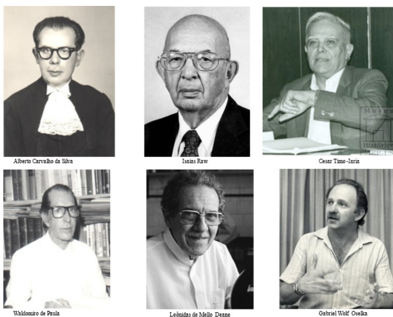
Figure 3. The Honored Professors of the ceremony that did not occur.