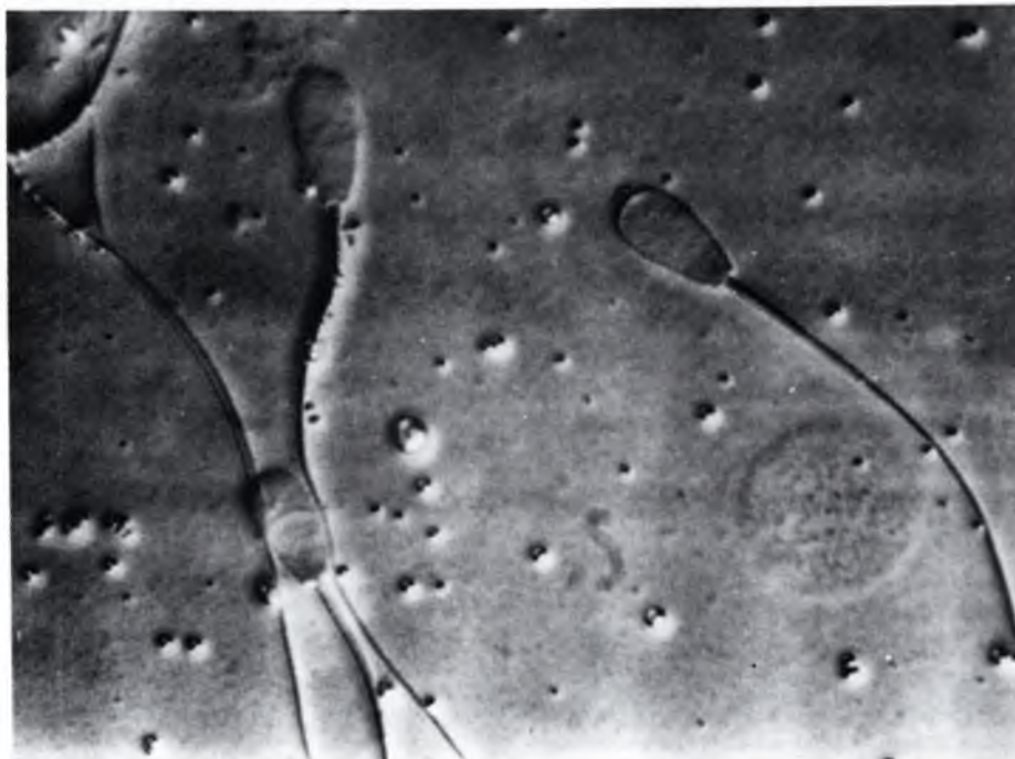
Figure 2 - Differential interference contrast microscopy. Bull spermatozoa. 1250 X