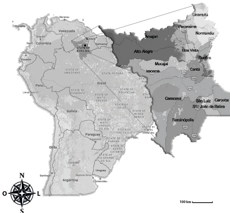
Figure 1 - Geographic localization of Roraima State, Brazil

Roraima State is located in the Amazon region (Figure 1). It is the Northernmost and least populated State of Brazil. It is bordered to the East by the State of Para and Guyana, to the South and West by the State of