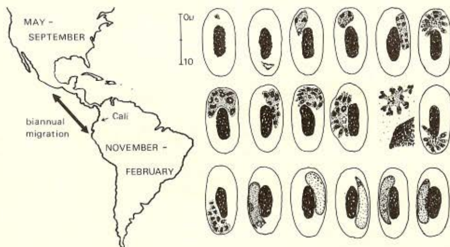
Fig. 2 — Migration pattern of Chordeiles minor from North to South America, and drawings of Plasmodium polare found in a juvenile nighthawk on its first trip south; Cali, Colombia, September 1973.

bird was most probably C. m. hesperis . If so, it would have been hatched during the preceding May or June in the Great Basin or western Rocky Mountains (British Columbia and Montana south to California, Nevada or Utah). The only other possible identification, considering its large size, is C. m. sennetti of the northern Great Plains and eastern Rockies (Eisenmann, pers. comm). The nighthawk was making its first migration to South America, and must