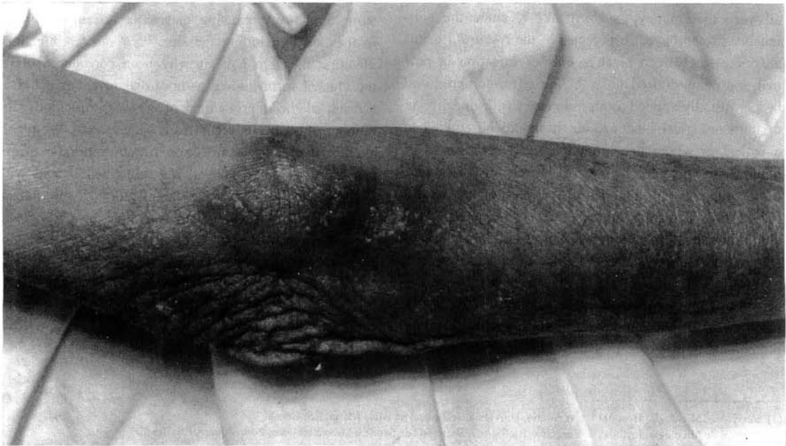
Fig. 1 - Cutaneous N. asteroides infection of nontraumatic origin: pustulous lesion on an erythematous base.

Cutaneous manifestation of nocardiosis may be the result of primary inoculation or of the seeding of the skin from a systemic infection. Nocardia infections affecting the skin are becoming more common as a result of the improvement of diagnostic methods, but attempts to classify the clinical forms reveals differences among authors 13 . We think that these infections may be considered under three distinct clinical forms: (1) acute primary cutaneous infection, (2) chronic primary cutaneous infection or nocardial mycetoma and (3) disseminated infection with skin involvement. In the acute primary cutaneous infection, the lesion follows inoculation and the agent grows in tissue usually as slender branching filaments. These cases appeared early as pyoderma, cellulitis, pustules or localized abscesses 10, 12, 13, 18, 26, 27 , similar in appearance to diseases caused by common pyogenic organisms. The histologic pattern is a mixed pyogenic and granulomatous reaction. Later it may develop the chancriform and lymphocutaneous syndrome 11, 15, 17, 21, 30 , mimicking sporotrichosis, that is usually caused by N. brasiliensis 15, 17, 18, 21, 22, 30 , but may also be caused by N. asteroides 11 and N. otitidisca-viarum 10 . The chancriform syndrome as described by WILSON 29 , is the clinical picture to be expected if a fungus, capable of causing deep mycoses, is acquired by direct cutaneous inoculation. This syndrome is cha-