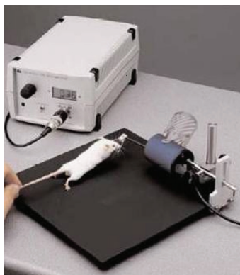
Fig. 1 - Grip strength meter for determining muscular strength in rodents.

The data were analyzed by repeated measures analysis of variance applying an interaction factor between time and experimental groups. All data were analyzed by SPSS-15 and the level of significance was p = 0.05 .