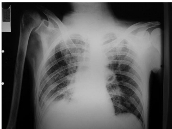
Fig. 2 - Chest radiograph showed the bilateral infiltrate due to Histoplasma capsulatum .