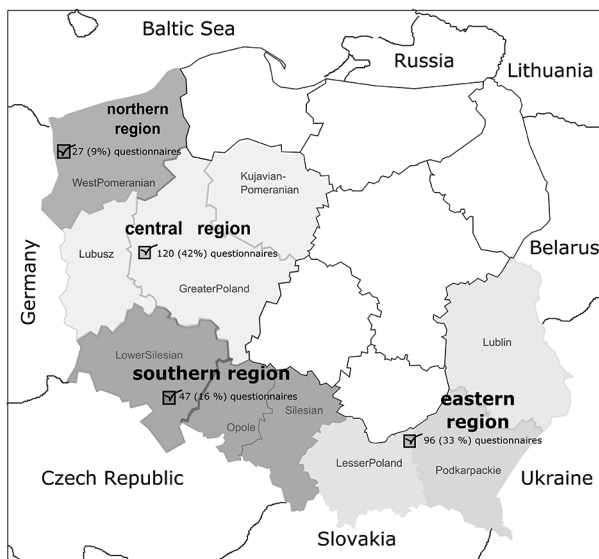
Figure 1 – Map of Poland and number of collected questionnaires from each region.

Data was prepared with the use of spreadsheets analysed by an "R" statistical program. "R" software is free and is used for statistical computing and graphics. It can also be extended via additional packages. In our analysis two of these packages were used, the aforementioned gmodels and vcd. Data had a categorizing character and two statistical tests i.e., Chi-Square Goodness of Fit Test and Cochran-Mantel-Haenszel, were used to analyze the data. With the use of these two tests, differences between the responses with various farm sizes and locations were checked. The p -values listed in the tables indicate how the response vary from one another. Values below 0.05 indicate significant differences between groups which signify different responses from farmers. When the p -value is closer to 1 the answers given are more equal in each group. This shows the unanimity of the opinions of farmers.