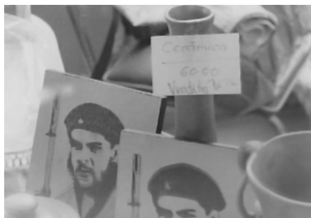
Figure 3: Pottery sold during the market.

Source: MIS/BH collection. Frames taken from the movie “Political Prisoners Exhibition” (October 22, 1977)