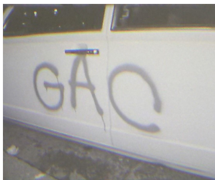
Figure 10: Graffiti of the Anti-communist Group.

Source: MIS/BH collection. Frame from the film "Amnesty of 45 – Meeting and Bomb" (April 19, 1978)