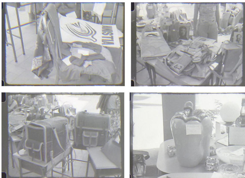
Figure 1: Objects displayed in the market of handicraft materials made by political prisoners. Frames taken from the movie “Political Prisoners Exhibition” (October 22, 1977)

The tape begins with images of bags, paintings, and various handmade objects produced by political prisoners and that are displayed on tables in a location where they seem to be exposed, as in a market (Figure 1). People walk through the tables and take notes.