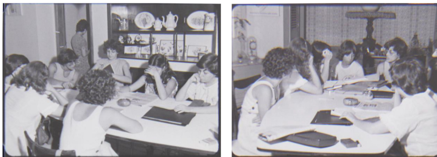
Figure 8: Members of the MFPA/MG during the meeting. Some women choose to cover their faces during the filming.

Source: MIS/BH collection. Frame from the film “Amnesty Movement – Interview” (January 31, 1978)