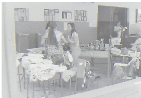
Figure 2: Hall housing the market.

The movement for amnesty, we women believe that, uh... that it's paramount... that amnesty is an imperative of conscience. So we aim to gain consciences, wherever they are: in schools, factories, barracks, universities, that's our job. Our weapon is the truth, and we seek to gain consciousness.