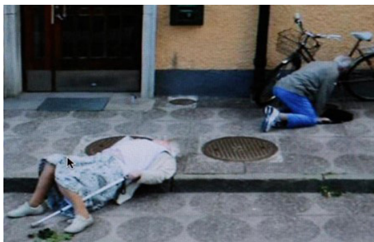
Figure 3: Photograph from the Street view – unfortunate events series, awarded at the World Press Photo 2011.