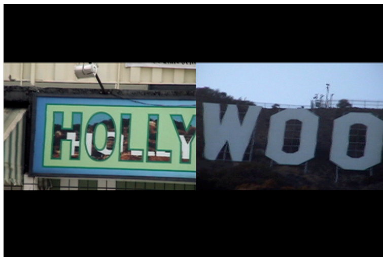
Video frame Jardim Califórnia :: Califórnia

Pairs of video projections were presented in the first exhibition: Canadá - Jardim Canadá, New York - Hotel Nova York, Califórnia - Conjunto Califórnia, Inglaterra - Lagoa dos Ingleses, China - Made in China, Paris - Vila Paris, Japão - Jardim Japonês.